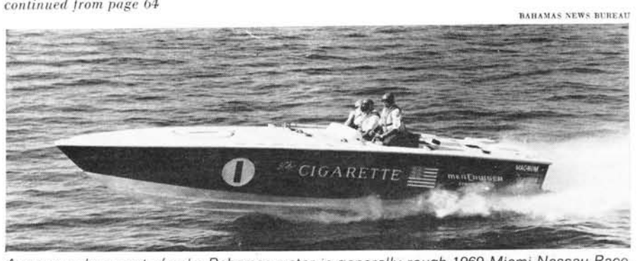
Aronow makes most of calm Bahamas water in generally rough 1969 Miami-Nassau Race.